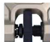
Fluorescent aligning marks unaligned