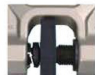
Fluorescent aligning mark aligned