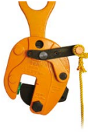
VERTICAL LIFTING CLAMP WITH REMOTE CONTROL (SVC-L) 0.5MT to 3MT