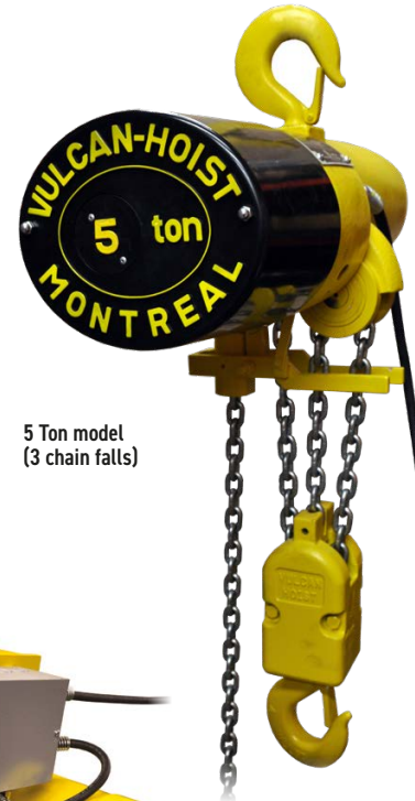
5 Ton model (3 chain falls)