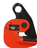
HORIZONTAL PLATE CLAMP (NHP) 0.75MT to 2MT