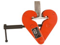
BEAM LAMP (NBC) 1MT to 10MT