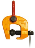
SCREW CAM CLAMP (SCC) 0.5MT to 6MT