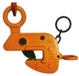
LATERAL LIFTING CLAMP (HLC-H) 1MT to 5MT