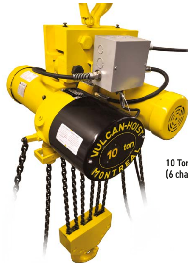
10 Ton model (6 chain falls)