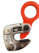
HORIZONTAL PLATE CLAMP (NHJ) 1MT to 2MT