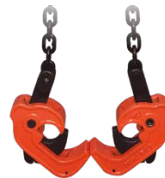
DRUM LIFTER (NDL) 1MT