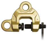
SCREW CAM CLAMP - DOUBLE EYE (SDC-S) 0,5MT TO 5MT